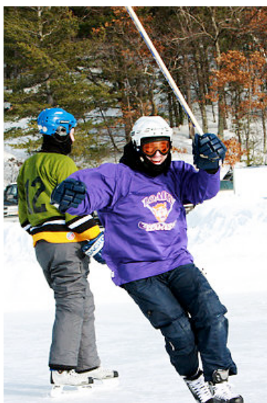
A player celebrates a goal.

A total of 22 states were represented this year. The bulk of the teams, especially the really good ones, hail from nearby