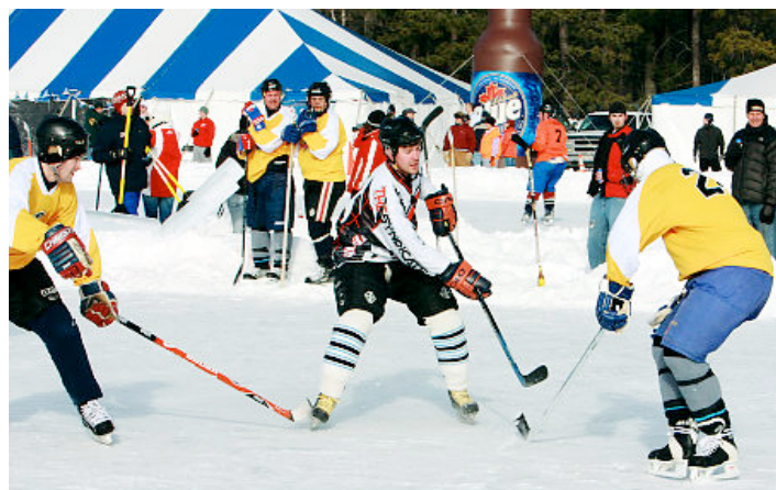
Skaters stick to it at the Pond Hockey championships in Wisconsin, where an all-New York City squad braved the sub-zero temperatures.

It was day one of the three-day Labatt Blue/USA Hockey Pond Hockey Championship in Eagle River, Wis., and as a dozen games played out on the frozen surface of Dollar Lake, a spectator described the many pleasures of good, old-fashioned pond hockey.